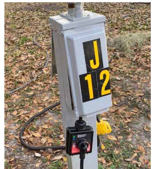
Surge protector plugged into RV site power with RV plugged in