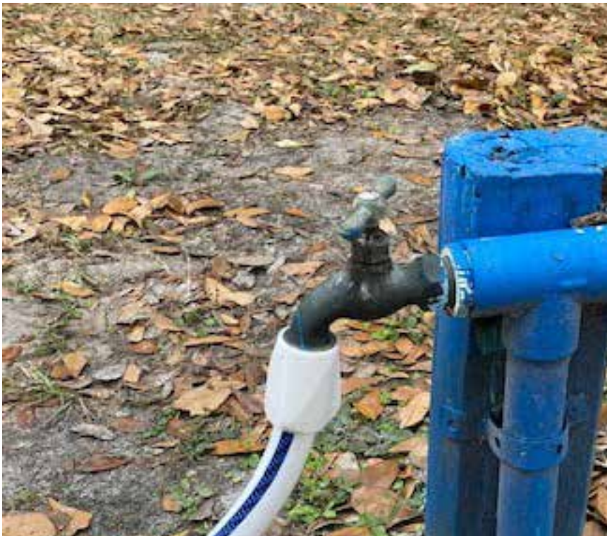
White water hose connected to city/campground water

The trailer has two main keys for the doors and access panels. Please, always keep them on you! Cost of replacement keys will be deducted from deposit as per addendum.