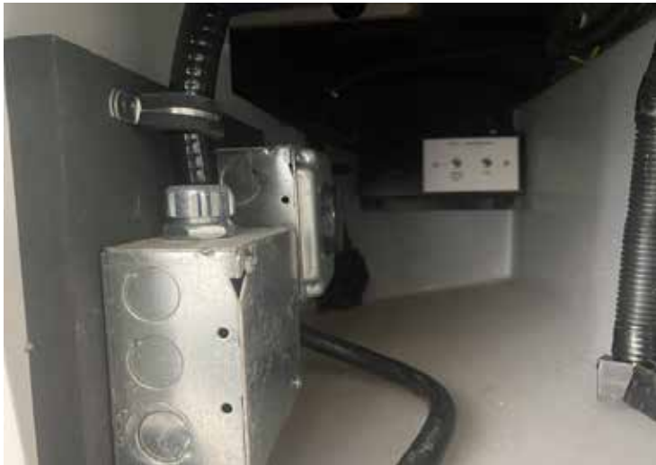
Close up of generator plug Area & Cord storage

IF NOT LIT CORRECTLY... STOP! Contact the campground, the power is wired incorrectly.