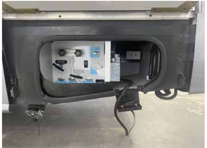
Hookups / dump controls 30A electrical area

If correct, plug in the RV into the surge protector.